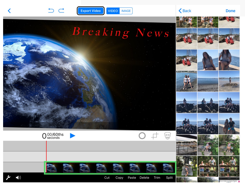
1st Layer: Select background Image or Video. Select "Done".