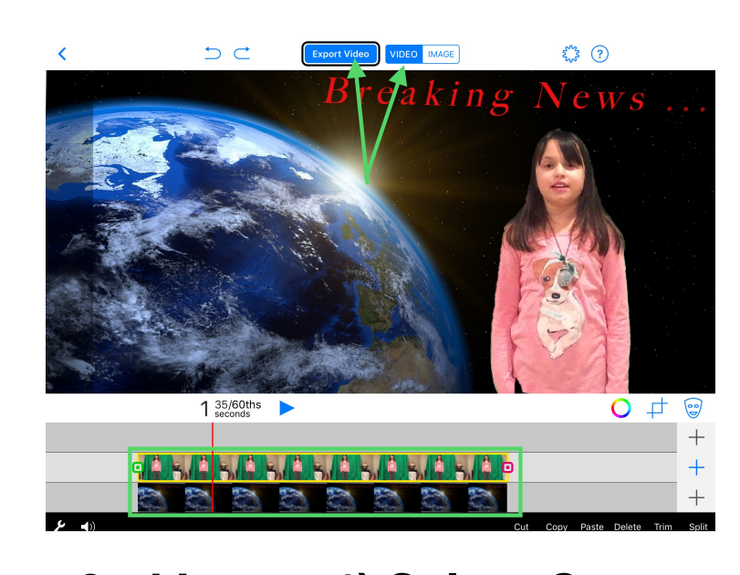
2nd Layer: 1) Select Green Screen Image or Video. 2) Tap "Done" 3) Tap "Export Video"