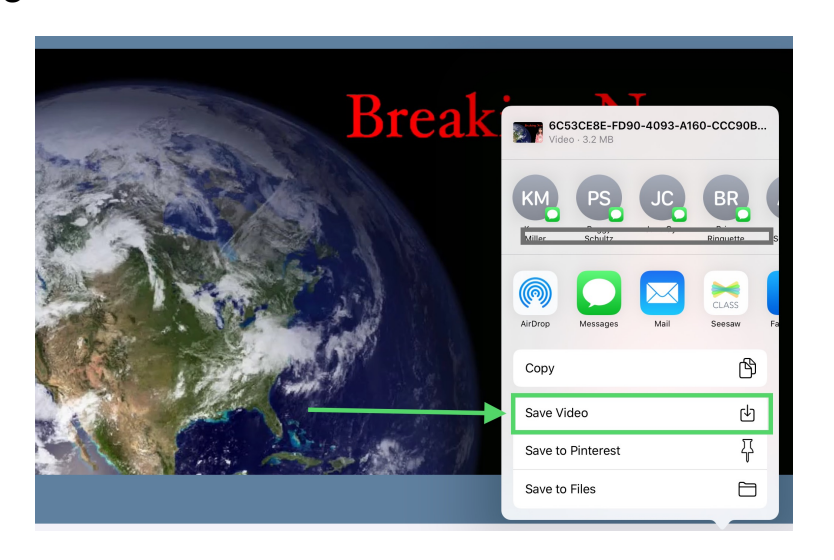
Select "Save Video" Success! Video is saved when you tap "OK". "Done" will take you back to the project view